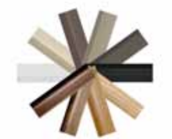
Have you seen more choice in a vinyl window?

90 degree angles make it much tougher for air to penetrate your home because our sashes fit down into deep pocketing jambs and sills.