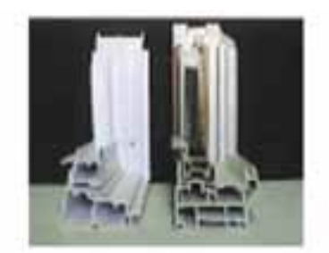
The beef is in a Polar Seal (right)