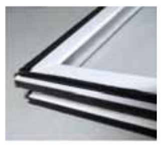
3 rows of weatherstripping

As winter gas bills soar, using the right kind of Low-E becomes even more important. Our "Hard Coat" Low-E has the same net heat loss as an R-19 wall because it allows more FREE solar energy in than any other Low-E option, including "Soft Coat".