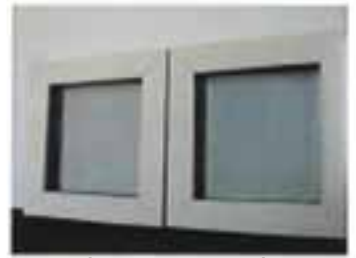
Darker Low-E reduces FREE energy from the sun (Polar Seal on left)